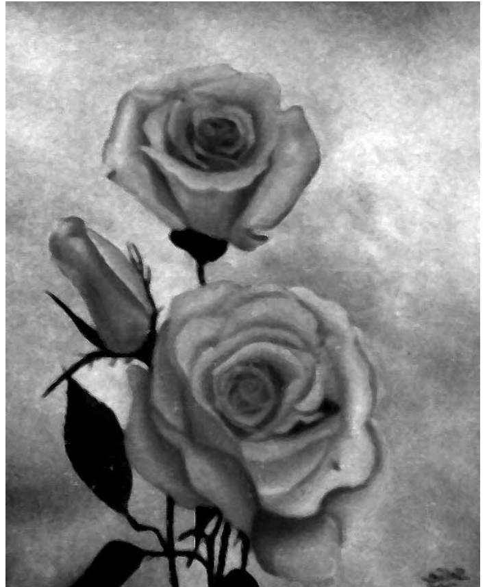
"Dew Drops" oil by Sallie Zigterman